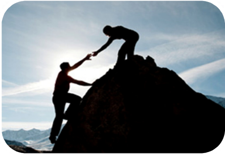
Familiarity provides reassurance