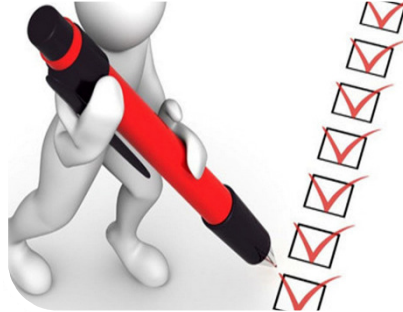
Preparation is ongoing/up to date