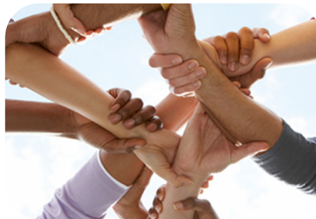
Support via local knowledge and language, networks