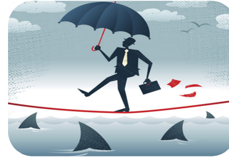
Risk management – one thing to have, another to implement