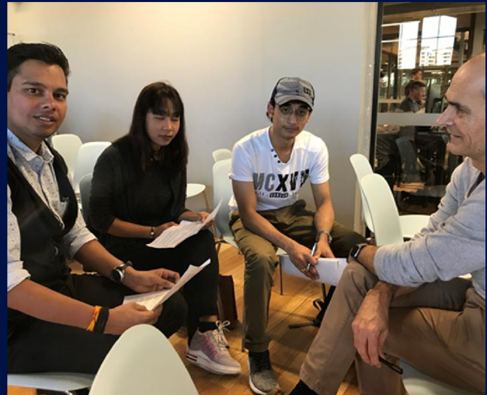
Student group at RCL meeting with their client, a Start Up Founder