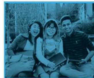
MODULE 4: INTERNATIONAL STUDENT LIFE