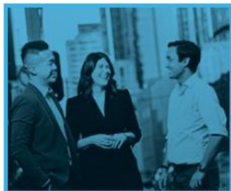
MODULE 1: INTERNATIONAL EDUCATION ESSENTIALS

In your own time, at your own pace... wherever you are in the world