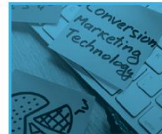
MODULE 5: MARKETING AND RECRUITMENT STRATEGY