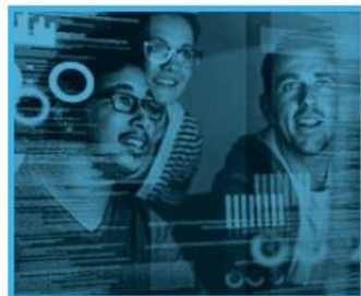
MODULE 2: DATA DEMYSTIFIED