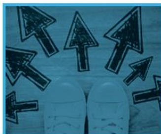
MODULE 8: PAVING PATHWAYS