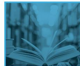
MODULE 10: TEACHING AND LEARNING ACROSS CULTURES