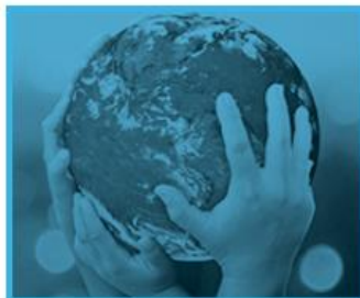
MODULE 3: MAPPING TRANSNATIONAL EDUCATION