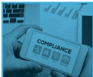
MODULE 6: ADMISSIONS AND COMPLIANCE ESSENTIALS