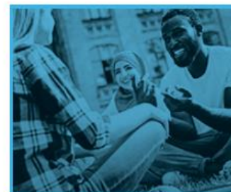
MODULE 9: SCHOLARSHIPS AND FELLOWSHIPS FUNDAMENTALS