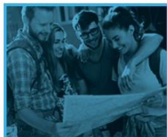
MODULE 7: UNPACKING LEARNING ABROAD