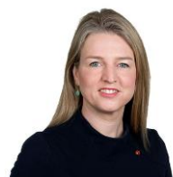
Senator Louise Pratt

Shadow Assistant Minister for Universities and Equality