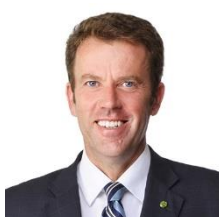
The Hon. Dan Tehan